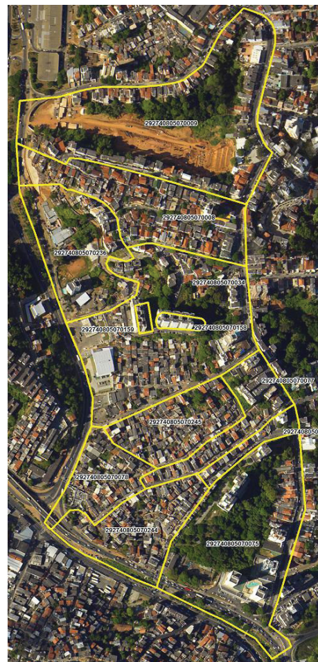
Figure 1: Delimitation of the area used for collecting sample data (areas of the study delimited by Google Maps).

The area described was mapped according to its main roads (aggregate), secondary roads, ways, alleys and smaller alleys, and divided into census sectors, as shown in Figure 1. The sample was distributed to keep representativeness for the