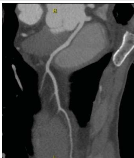
Figure 2: The left main coursed between the ascending aorta and pulmonary trunk and gave off the left anterior descending (LAD) and left circumflex (LCX) coronary arteries in their normal position.