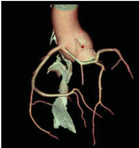
Figure 1: Volume rendering reconstruction showed the left main and right coronary artery (RCA) arising separately from the right sinus of Valsalva.

Volume rendering reconstruction showed the left main and right coronary artery (RCA) arising separately from the right sinus of Valsalva (Figure 1). The left main coursed between the ascending aorta and pulmonary trunk (Figure 2) and gave off the left anterior descending (LAD) and left circumflex (LCX) coronary arteries in their normal position.