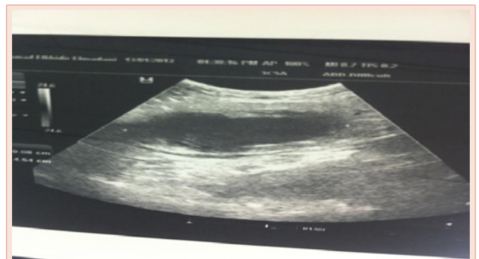
Figure 1: Ultrasonography of the abdomen revealed a left iliac fossa cystic mass.

Laboratory investigation revealed: hemoglobin 11.5 g/dl; total leukocyte count 8510/cumm with a differential count of 54% neutrophils, 42% lymphocytes and 4% eosinophils; Erythrocyte Sedimentation Rate 70 mm and ELISA for HIV negative. The chest radiograph was unremarkable. Other biochemical blood investigations were within normal limits. Ultrasonography of the abdomen revealed a 6.5x8.5cm left iliac fossa cystic mass with a liquefied necrotic center in the anterior abdominal wall (Figure 1). Computerized Tomography scan of the abdomen showed an abscess in the left antero-lateral portion of the abdominal wall limited to the muscle layer (Figure 2). Ultrasound-guided fine-needle aspiration and cytological examination revealed caseating granuloma with central necrosis, lymphocytes, and giant cells, consistent with tuberculosis (Figure 3). The patient was diagnosed to have tuberculous abscess of the anterior abdominal wall and antituberculous treatment was started. She improved rapidly over the next few days. After four weeks' antituberculous treatment (ATT), she responded well to the