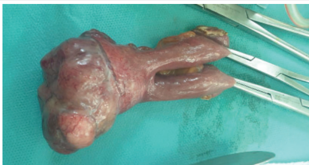
Figure 2: Resection specimen showing exophytic ileal tumor mass.