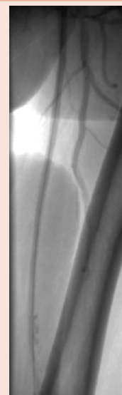
Figure 3: Superficial femoral artery view after the angioplasty and stenting.

Adam et al. published in 2005 the multicenter randomized BASIL (Bypass versus Angioplasty in Severe Ischemia of the Leg) trial [8] which showed that there are no overwhelming advantages of angioplasty over surgery for patients with chronic critical limb ischemia (CLI) due to infrainguinal lesions. Similarly, the 30-day mortality as well as the 6-month amputation-free survival was similar in both strategies. However, surgery was associated with a higher morbidity (57% vs. 41%), mainly due to wound infection and myocardial infarction and was more expensive during the first year, due to the longer hospital stay. Angioplasty on the other hand, showed higher failure rates (20% vs. 3% at 1 year), resulting in higher re-intervention rates (27% vs.17%).