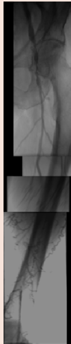
Figure 1: Superficial femoral artery occlusion of the left, 37 cm in length, origin in the ostium and continued to the distal level.